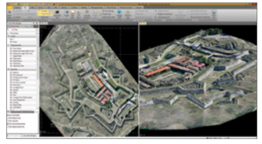
Integrate Trimble VISION and UAS data to produce high-value deliverables