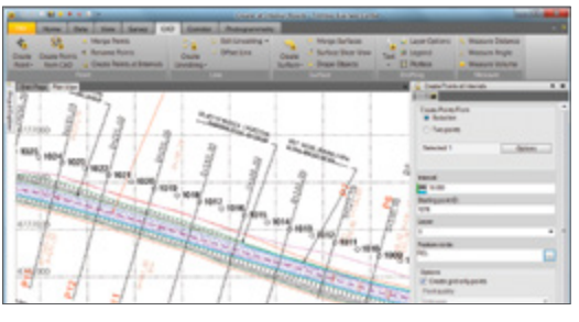
Automatically create points at horizontal and vertical offsets from an alignment for stakeout