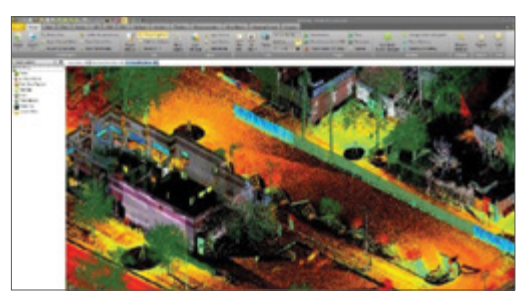
Efficiently combine point clouds with imagery and survey data to create unique survey deliverables with confidence